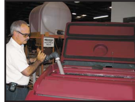
Optional Rapid Fill Station available, helps refill solution quickly